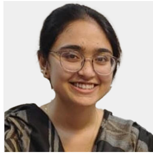
Isha System Engineer