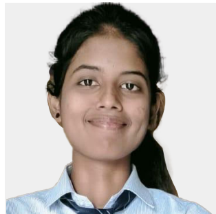
Shraddha System Engineer